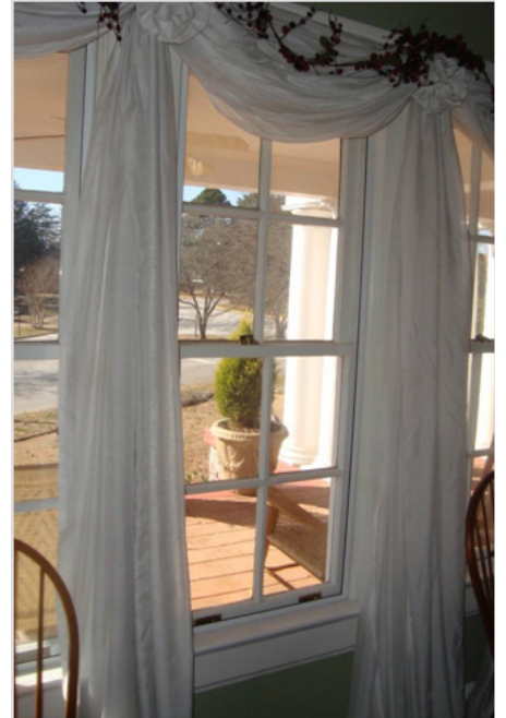
Custom Interior Storm Windows

Saving energy is a passion of mine, and what better opportunity than in the 1925 house that we purchased in 2006? A designated historic house in Avondale Estates, the house had minimal main-