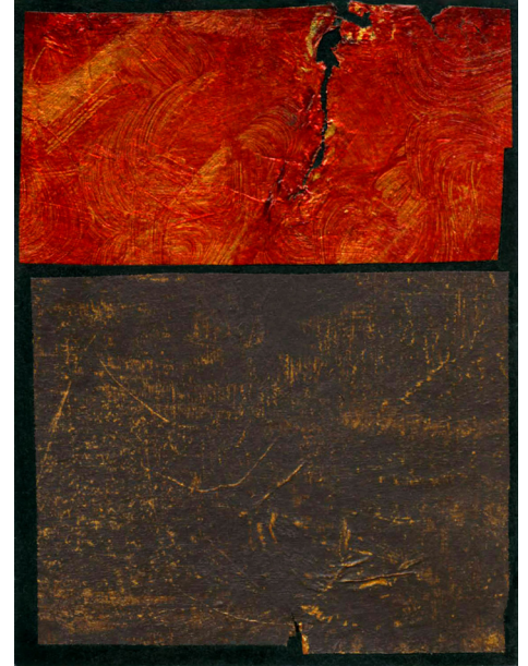
Into Earth

When my oldest son was about 18 months old, one of the first objects he learned to name was a bus. We would all be driving around town and he would yell at the top of his little